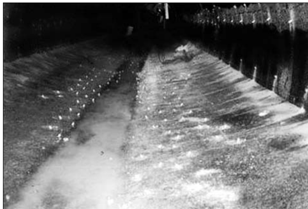
Gel encapsulation injection.

Tested and certified by WQA according to NSF/ANSI-61