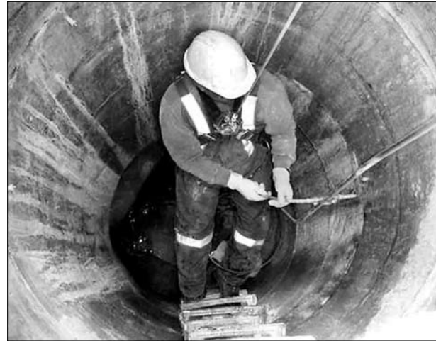
Manhole joint injection.

Water Quality Association has tested Azo-Grout 675 in accordance with the National Sanitation Federation (NSF) standard 61 and has approved this material for contact with potable water.